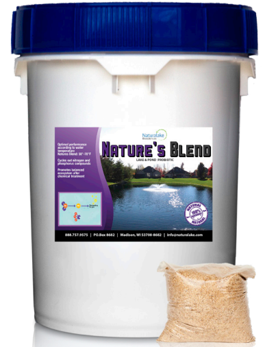
Nature's Blend is available in 10 and 30 pound containers.