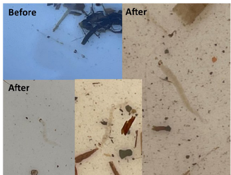
Above: Pictures of living (before) and dead Chaoborus midges (after) the AQUABAC ® xt treatment.

Swarms of the non-biting phantom midge (Order: Diptera, Family: Chaoboridae) became a major nuisance for residential homeowners at the Preserve in Ponte Vedra Beach, Florida, beginning in the spring of 2022. The source of these infestations was one of the two community stormwater ponds, both of which were built in 2016.