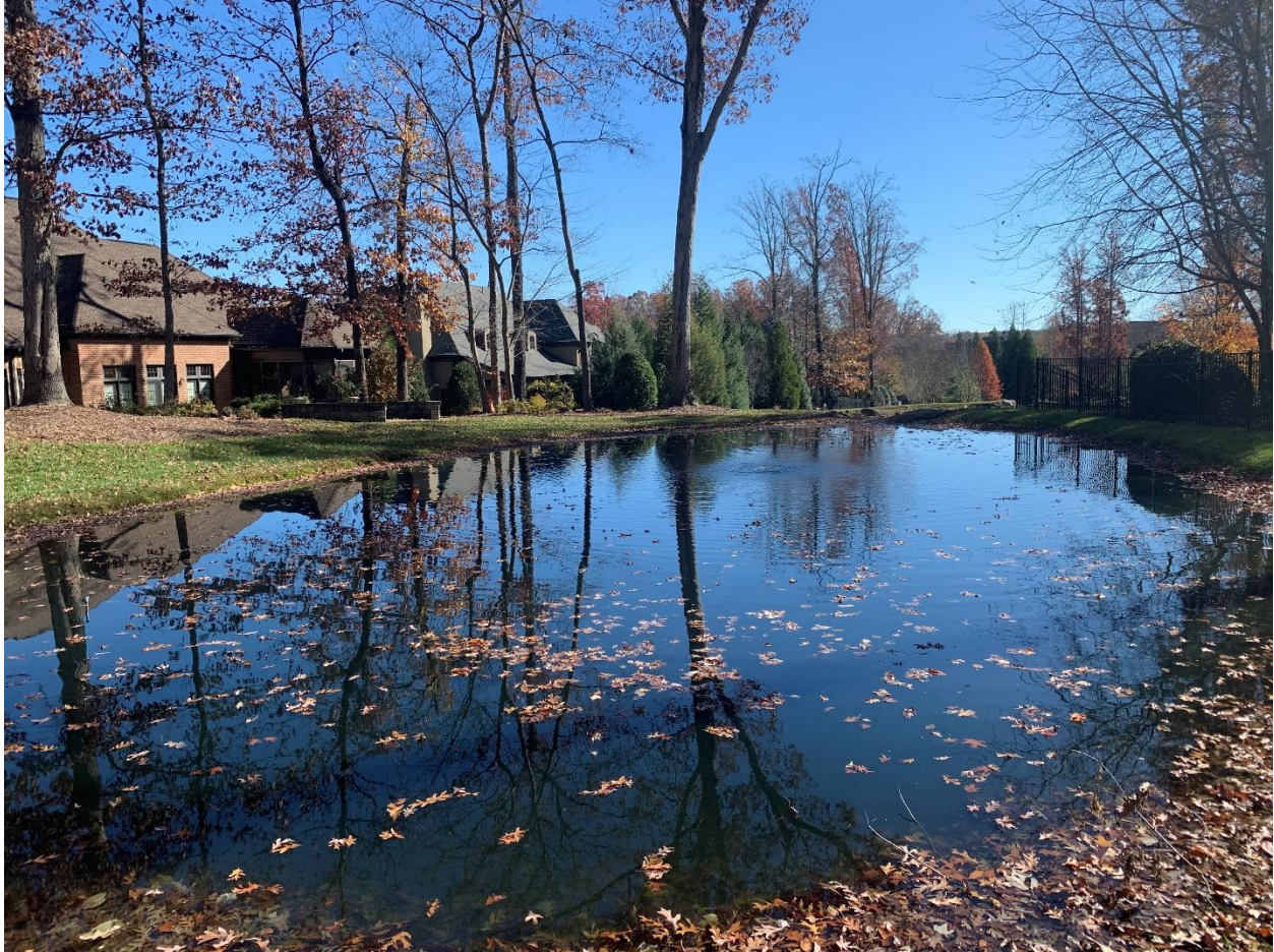
Pond 7: One diffuser head from bottom aeration; 0.11ac