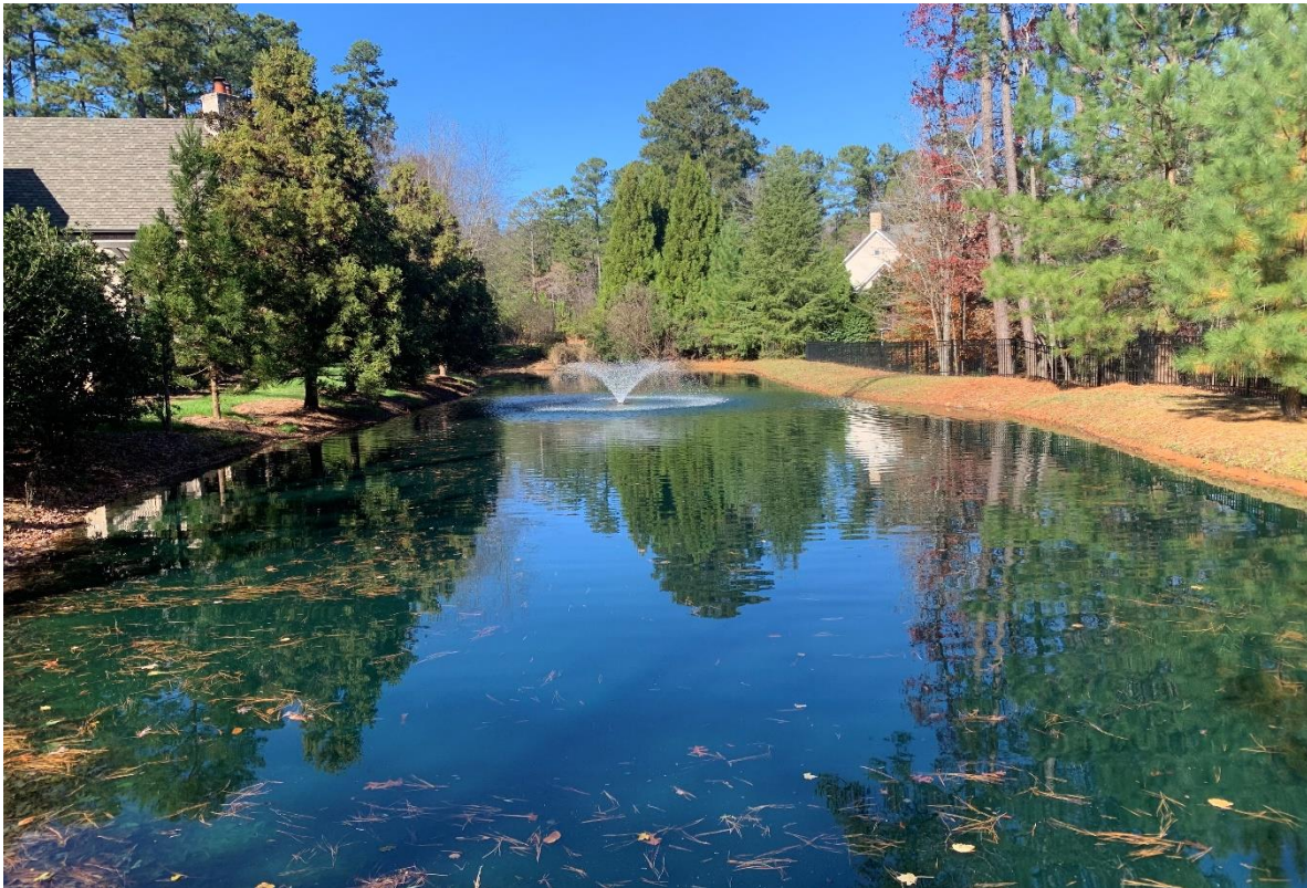
Pond 6: Classic aerating fountain; 0.23 ac

Foster Lake and Pond Management (FLPM) began a pond maintenance program with a new HOA in March 2017. On March 22, 2017 an initial assessment of the muck layers was done in pond 6 and pond 7. Pond 6 had an existing aerating fountain centered in the middle of the pond. Pond 7 had a diffused aeration head installed in April of 2017 with no existing aeration prior to the installation. During monthly pond maintenance, a muck reducing bacteria, made by Naturalake Biosciences, was also added to each pond. FLPM added the MD Pellets at a rate of 10 pounds per acre, per month when water temperatures were above 60 degrees. On May 21, 2018, 1 year after starting, sampling of the muck layer was completed. This report will review the results from the last sampling and compare bottom aeration to fountain aeration.