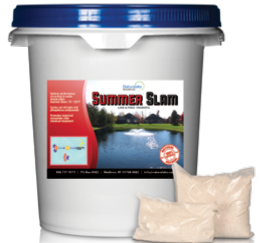
Summer Slam is available in 10 and 30 pound containers.