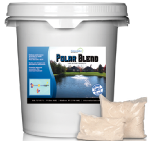
Polar Blend is available in 10 and 30 pound containers.