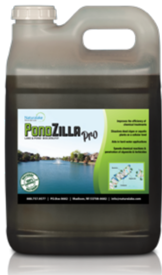
PondZilla Pro is available in multiple container sizes: 1, 2.5, 55, and 275 gallons.